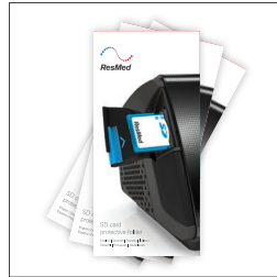
SD card with protective folder 37334 (1 pk) 37332 (10 pk) SD card reader 36931