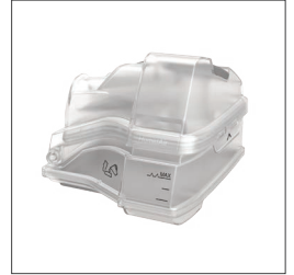
HumidAir heated humidifier 37300 Cleanable tub