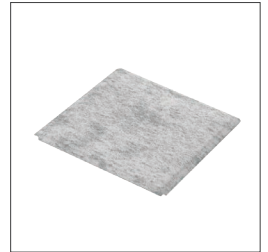
Filters – standard 36850 (1 pk) 36851 (2 pk) 36852 (12 pk) 36853 (50 pk) Filters – hypoallergenic 36855 (1 pk) 36856 (2 pk) 36857 (12 pk) 36858 (50 pk) Filter cover 19729 (AirSense 10) 19768 (AirSense 10 AutoSet for Her)