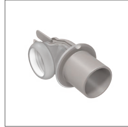
Air outlet 37310