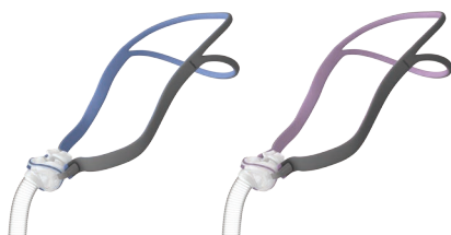
AirFit P10 – nasal pillows mask