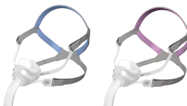
AirFit N10 – nasal mask