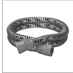
SlimLine™ tube 36810