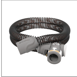
ClimateLineAir heated tube 37296