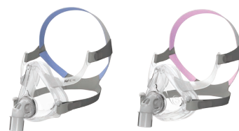
AirFit F10 – full face mask