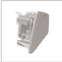
Side cover 37335 Grey 37303 Charcoal