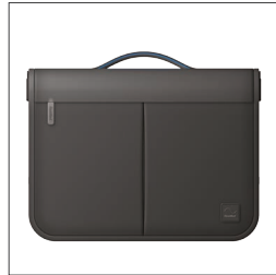
Travel bag 37304 Travel bag for Her 37305