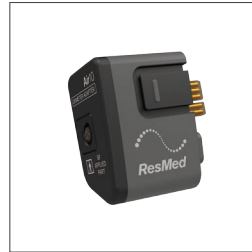
Oximetry module* 37302 Oximeter converter cable 36941 Nonin XPOD oximeter 22374 Reusable soft sensor (medium) – 3 metre cable 70568